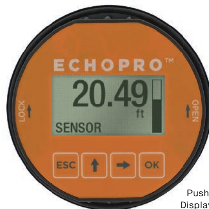
Push Button Display Module