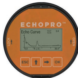
Echo Signal Return Curve