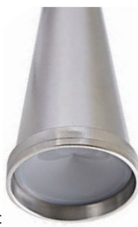
PTFE Dust Shield

The sensor is offered in two antenna sizes including 4" (98mm) and 5" (123mm) with or without a dust shield. The larger the antenna, the narrower the beam and the stronger the RF signal return. To select the appropriate antenna size and configuration, consider two variables; The measured span distance and the amount of dust within the span. In general, select the 4" (98mm) horn for shorter spans and the 5" (123mm) horn for longer spans. As for dust, when minimal, select the horn only. When moderate, select the horn with dust shield, and when significant, select the horn only and apply a periodic compressed air purge.