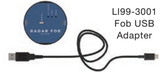
LI99-3001 Fob USB Adapter